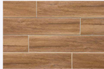
Wood Plank Look